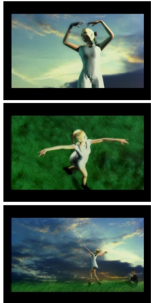
Figure 1: The shots in the images above, from the South Korean version of Elysium and the official music videos, don't exist in the English version.

The South Korean Elysium , about 72 and a half minutes long, was found on a DVD most likely imported from China in 2003 or 2004. It has Korean audio and Chinese and English subtitles. This version tells the story of four individuals, Nix, Van, Paul, and Christopher, selected to protect the Earth from