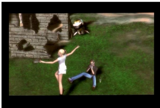
Figure 2: The shots above appear in the English version of Elysium as alternatives to the shots seen in Figure 1 and don't appear in the South Korean version.

At about 85 and a half minutes long, the English version of Elysium contains thirteen minutes of footage that don't exist in the South Korean version. The film was originally produced in English and has been translated and redubbed into other languages such as German, Italian, Polish, and French. The English dialog roughly mimics the Korean script, but translations of the English version into other languages are much more loyal to the English dialog than the English was to the Korean. In this version, four individuals, Nyx, Van, Paul, and Christopher, are chosen to protect the Earth from evil. With their giant armors, known as Ancient Ark Warriors, the heroes must stop Necros, the general of an alien race known as the Elysium. As the descendent of an ancient Elysium sect of demons known as the Tenebran, Necros wants to free his ancestors from their prison beneath to Earth's surface. The beginning has more shots that transition characters between scenes and places, which improves the pacing over the South Korean version. An added narrator also ties together the residual awkwardly placed scenes. The rest of the movie remains mostly loyal to the South Korean version but occasionally adds anywhere from a few seconds to entire scenes of footage that didn't exist before.