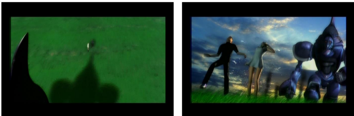
Figure 5: Shown here are two shots of Lydia's death from the South Korean Elysium that don't exist in the English version.

The English version, however, arbitrarily excludes content that appeared in the South Korean version, which shows a disregard for the original. For example, the removal of the pink robot in scene 24 of the South Korean version has no discernable purpose. Even if the character was an addition to the South Korean version that didn't originally exist, the robot didn't detract from the scene, someone who was likely on the original team animated it, and it served as a preview to a character that appears later. As another example, scene 17 in the English version removes the shots of the battle armors chasing Van and Lydia as seen in the South Korean version (see Figure 5). A low-angle, medium-full shot of Lydia falling replaces them. While the concept that a giant armor appears in the middle of a romantic scene to chase Van and Lydia, kill Lydia, and allow Van to lament over her death is ridiculous, this alternative shot doesn't make it less so or improve it. There's no reason to remove these shots if the purpose of the film is pay homage to the original.